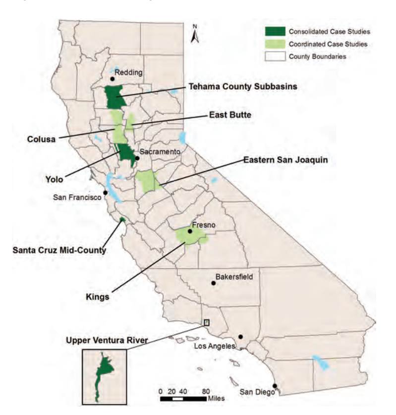
Figure 3. Locations of eight case studies of consolidated and coordinated basin governance

The above analysis of GSA formation notices indicates that groundwater basins subject to SGMA will be governed through both consolidated (single GSA) and coordinated (multiple GSAs preparing one or more GSPs) approaches. What do these arrangements look like in practice, and what conditions appear to lead local agencies to choose one path over another? We draw upon observations and interviews in eight case studies to shed light on these questions.